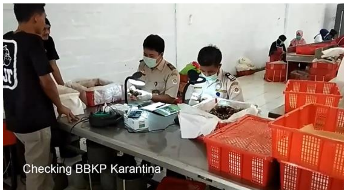
Checking BBKP Karantina