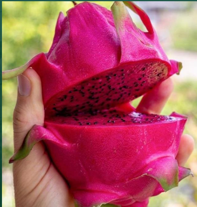
Dragon Fruit Red