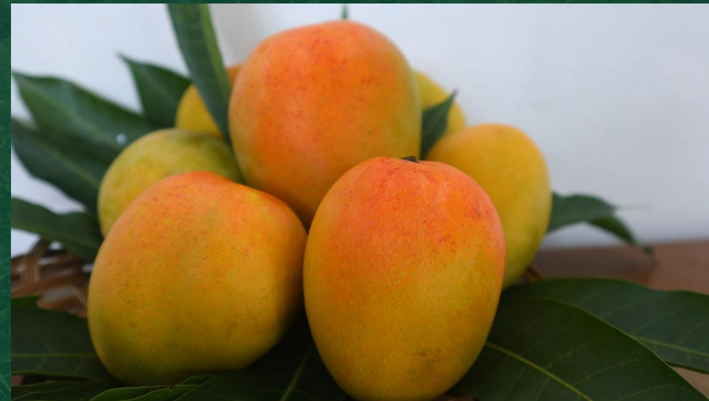
Gedong Gincu Mango