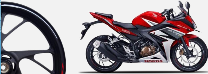
HONDA CBR150 (17 X 2.50/17 X 2.50)