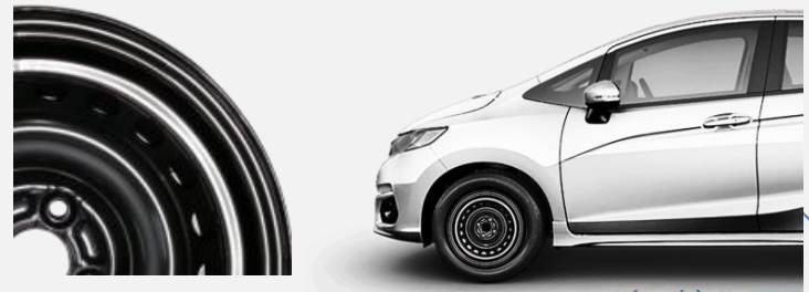
HONDA JAZZ (15 X 5.5)