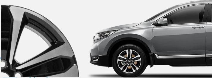
HONDA CR-V (18 X 7.5)