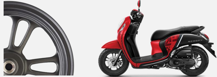
HONDA NEW SCOOPY (12 X 2.15/12 X 2.50)