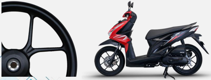
HONDA NEW BEAT (14 X 1.85/14 X 2.15)