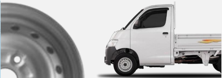
DAIHATSU GRANMAX (14 X 5.5)