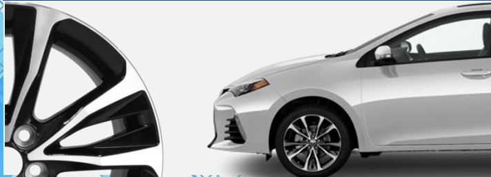
TOYOTA COROLLA (17 X 7.5)