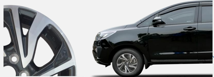
TOYOTA NEW INNOVA (16 X 6)