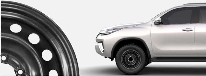
TOYOTA FORTUNER (17 X 7.5)