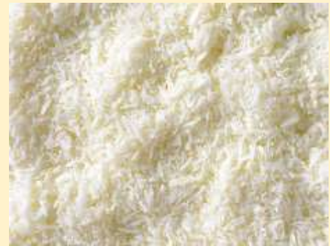
DESICCATED COCONUT (High Fat, Low Fat, Fine, Medium)