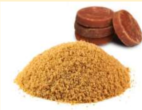
COCONUT SUGAR (Also available in solid form)