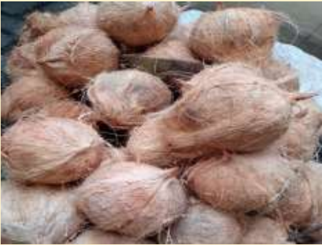
SEMI HUSKED COCONUT