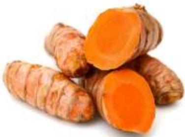
TURMERIC (Whole & Powder)