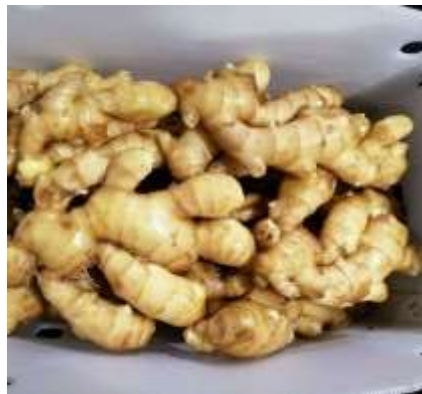
GINGER (Whole & Powder)