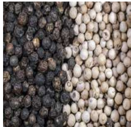
BLACK PEPPER AND WHITE PEPPER